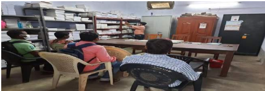
Netaji Subhas Open University Study Centre

8. Netaji Subhas Open University: We have a study centre of Netaji Subhas Open University in our college. Select Diploma Courses, U. G & P.G courses are facilitated by this centre.